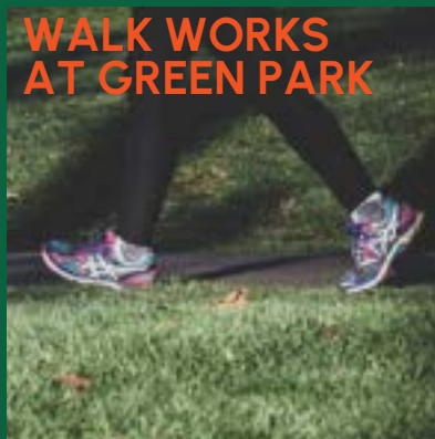
WALK WORKS AT GREEN PARK