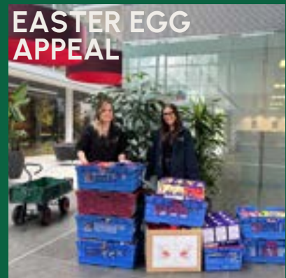
EASTER EGG APPEAL