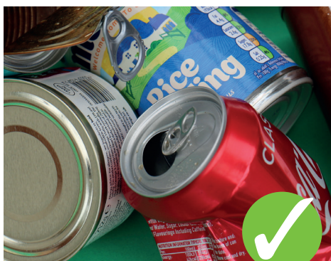
Food tins and drink cans (please rinse)