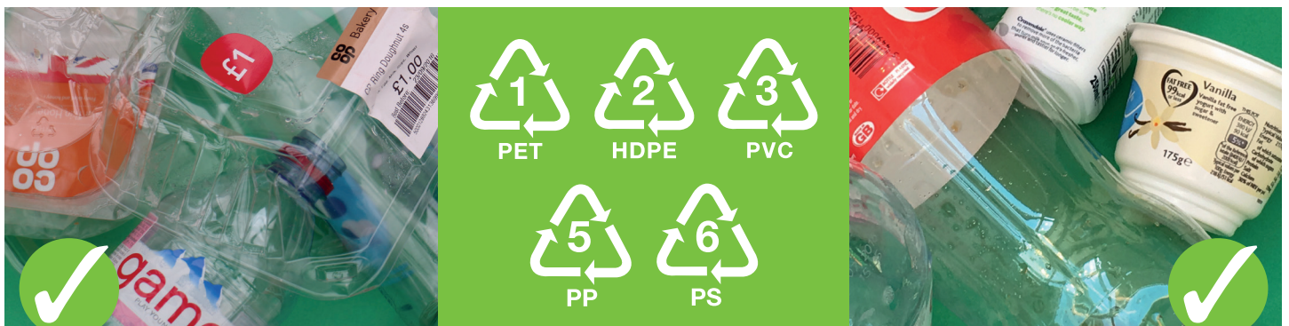
Clean plastic bottles, containers, trays and yogurt pots that feature the above symbols (please rinse)