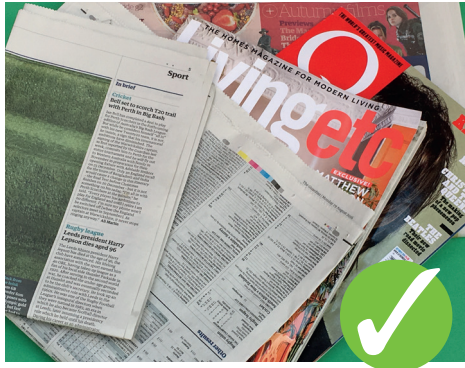
Magazines and newspapers