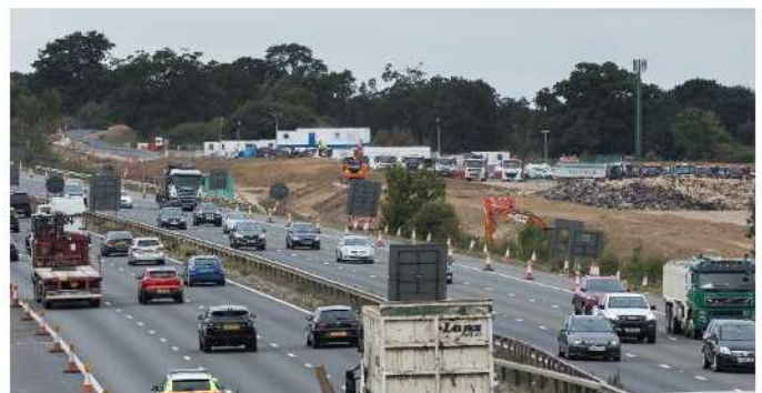
Works and traffic management underway on the M4